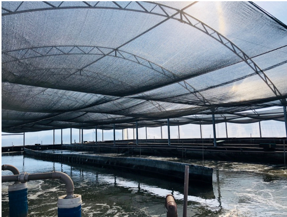
Raceways at the Marine Aquaculture Station, Universidade Federal do Rio Grande (FURG) in Brazil. Aeration intensity is very important for the nitrification process in biofilm in intensive biofloc technology (BFT) aquaculture systems.

Nitrogen compounds are considered one of the main problems in intensive and super intensive shrimp systems. Ammonia and nitrite present the highest toxicities for the organisms produced, affecting their growth, stocking process, feeding and survival. However, these elements can be efficiently absorbed and transformed into additional protein by bacteria present in systems using biofloc technology (BFT).