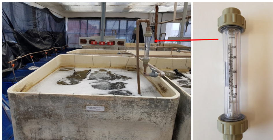
Left: View of experimental unit with coupled rotameter (right); rotameter used to control aeration intensity (left).

air flow rate in all treatments, a commercial rotameter (Tecnofluid® TRP-255-H-7 1 POL NPT) was coupled to the aeration system.