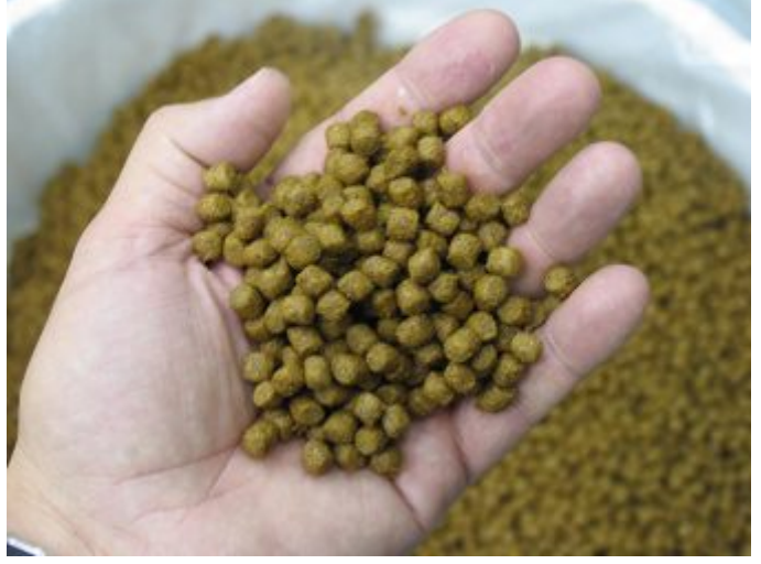
Use of the best feeds possible is an integral and critical part of the tilapia farming process.