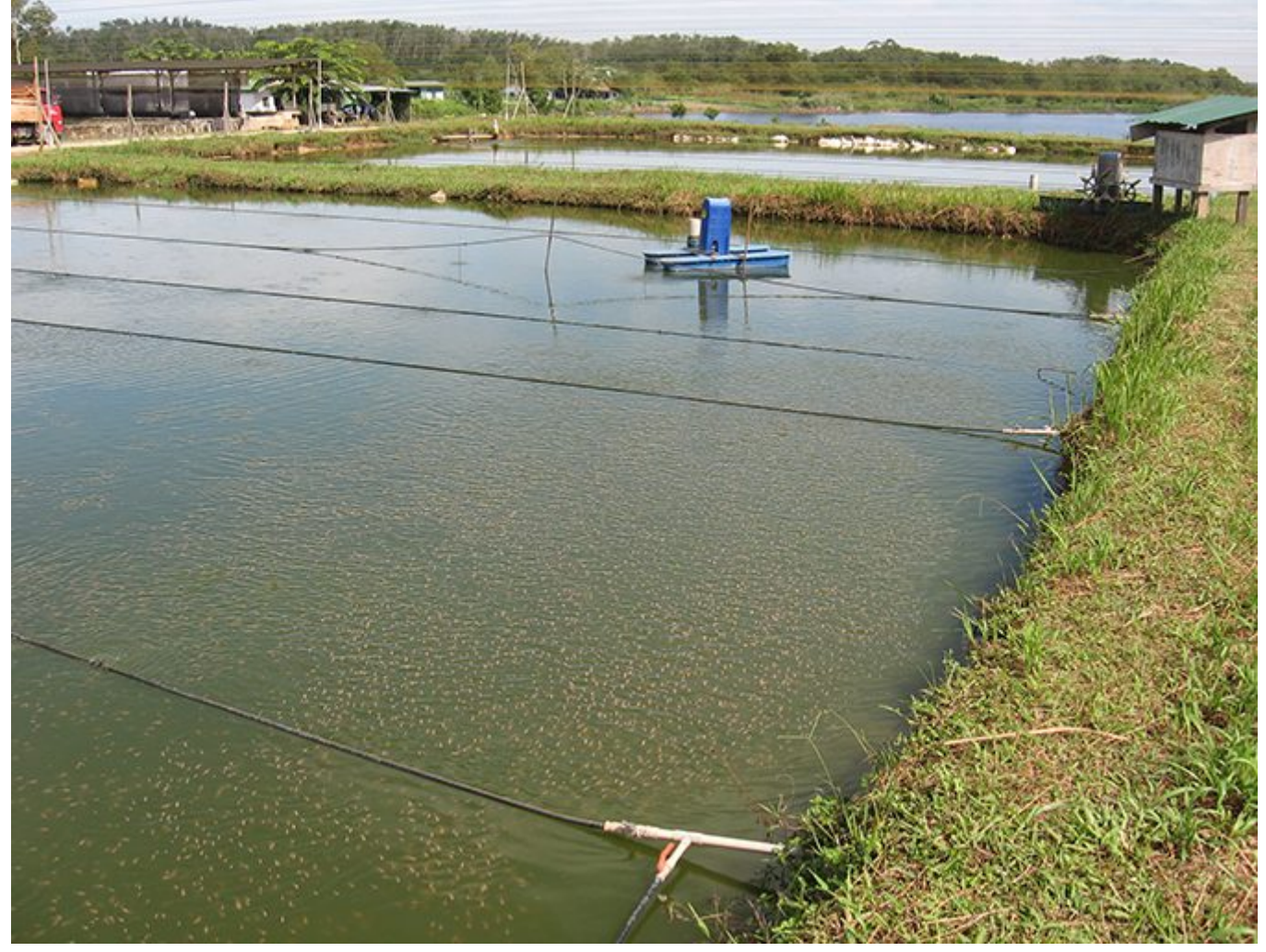
Only healthy seedstock, with proper health certificates when possible, should be stocked.

Although these stocking densities may not seem highly productive, many successful farmers have adopted these conservative practices to avoid losses caused by biosecurity problems. Their experiences, combined with some effective sanitary programs implemented by government offices (federal and state) in the last several years, have improved productions statistics in the Latin American region. These programs are focused on the supervision of good management practices, verified through periodical visits to the facilities, and by on-site sample analyses carried out by qualified personnel.