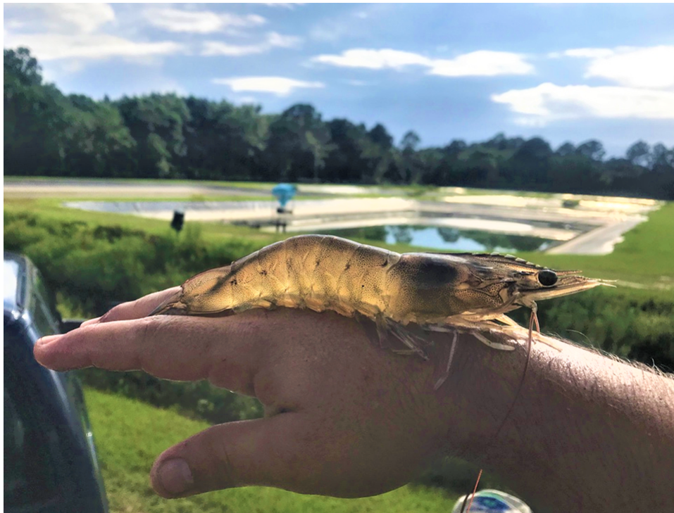
Pacific white shrimp harvested from experimental ponds.

Shrimp feeds are the most important variable cost, source of nutrients and biological waste in semi-intensive and intensive systems. Albeit currently available feeds are generally considered adequate, there are several studies focusing on optimizing shrimp nutrition through either feed formulation or feeding protocols. As with other species, there are multiple studies and commercial reports validating production viability with less-costly, more sustainable soy-based feeds. However, feed management is the conjugation of nutritional content and feed delivery mechanism. While much research focused on nutrition and feed formulation, little effort is put into feed delivery practices. Hence, our group focuses on improving feed management techniques through systematic evaluations of different techniques.