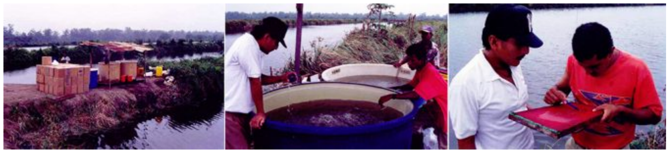
View of temporary acclimation stations for shrimp postlarvae on a levee of the pond to be stocked. Note stacks of cardboard transport boxes (left); acclimation tanks (center); and counting of PL.

Animals are maintained under these conditions for one hour, and survivors (animals that swim and respond normally) counted. The population is considered to have passed the test if survival rate is 80 percent or higher.