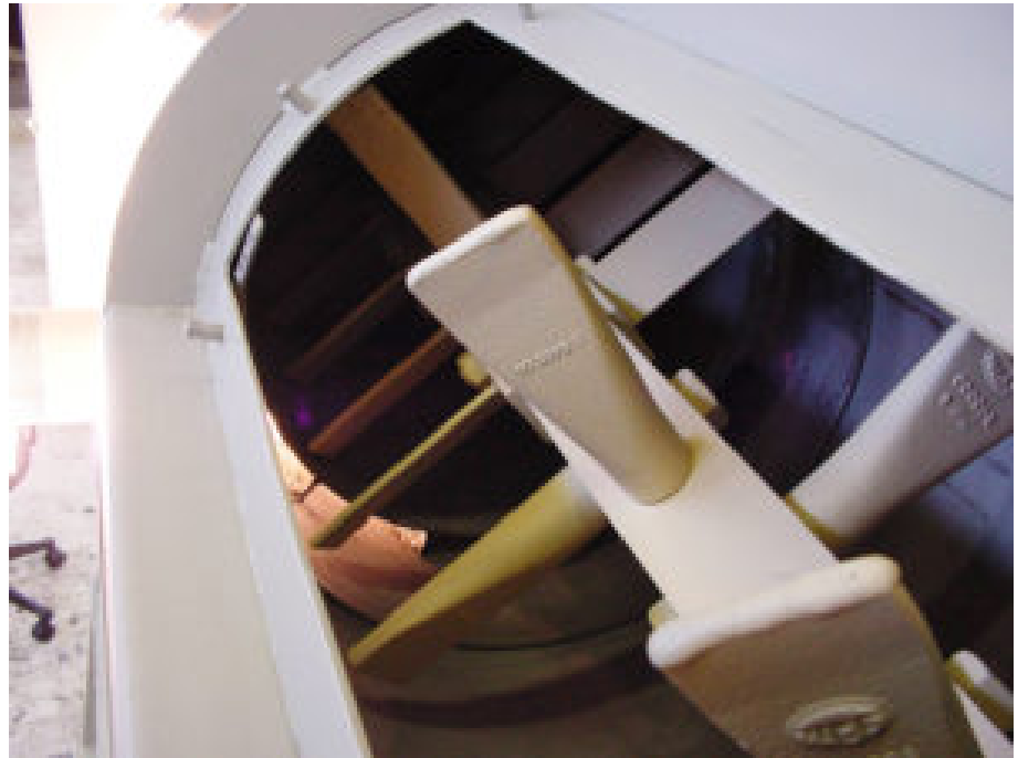
Preconditioner mixing zone.

Since steam is a gas, it tends to fill the voids in preconditioners. When this happens, less steam contacts the mix to heat and hydrate it. Therefore, increasing the fill ratio improves not only the residence time but also the temperature and hydration uniformity of the mix.